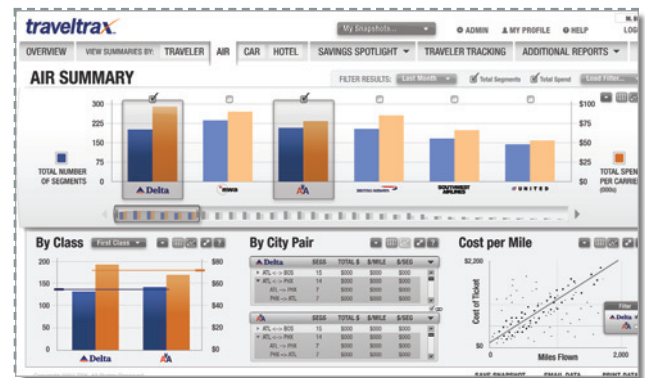
Air Summary: See what is driving a cost or budget variance by viewing more detail on an individual spend category. Air Summary reporting identifies savings opportunities by providing you with clear, visual insight into trends and activities that are driving up your costs.

Corporations want simple access to high-quality, objective, consolidated data – and clear recommendations on how to control and reduce travel spending. With TRAVELTRAX, you get clean, complete travel data you can trust, allowing you to take action with confidence to reduce costs. TRAVELTRAX demystifies the murky and inconsistent world of travel spending and enables you – both the career professional and the more reluctant travel manager – to successfully manage your global travel spending.